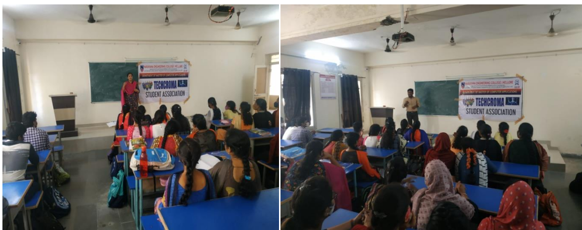
Student Coordinators are explaining Coding tips to the students